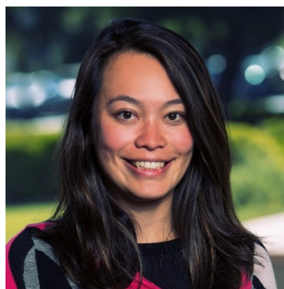
Angel Pu Warburg Pincus